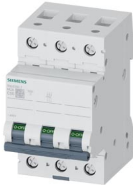
Miniature circuit breaker 400 V 6kA, 3-pole, C, 50 A